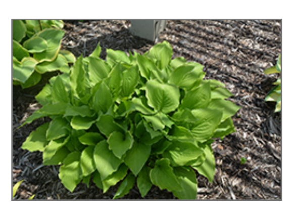
Savannah Hosta

A bright green, glossy leaf that is edged with subtle chartreuse and white; leaf is heart shaped, with a lightly wavy margin; spikes of pale lavender flowers in late summer to early fall; a fantastic colorful specimen in the garden or border