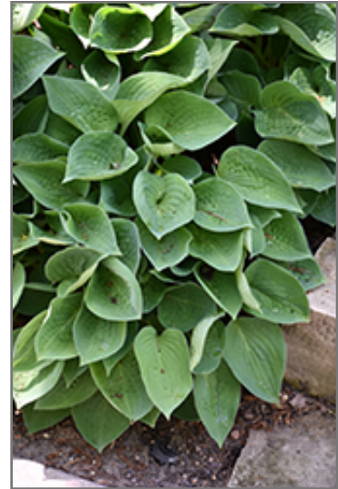
Peter Pan Hosta