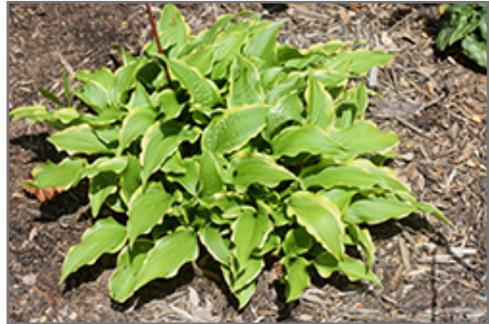
Lakeside Hoola Hoop Hosta

Lakeside Hoola Hoop Hosta is recommended for the following landscape applications;