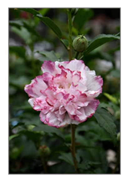
Danica Rose of Sharon flowers

Danica Rose of Sharon is recommended for the following landscape applications;