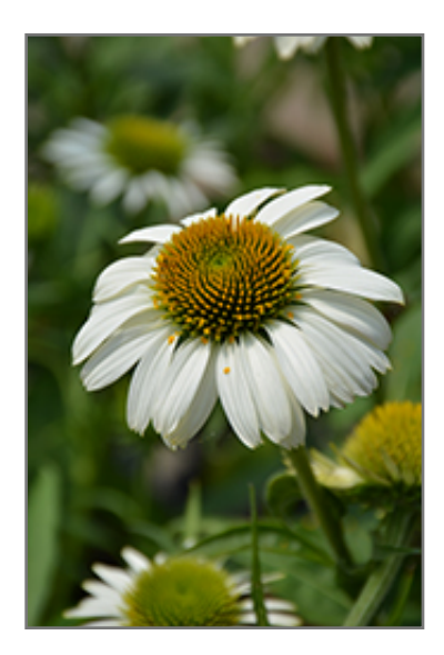
Prairie Splendor Compact White Coneflower flowers

A lovely, compact selection that produces large white flowers with coppery-gold centers; this early bloomer is a perfect choice for planting in groups, along border edges, or in containers; great for flower arrangements; attracts pollinators