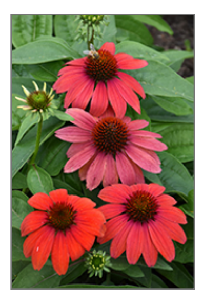
Artisan Red Ombre Coneflower flowers