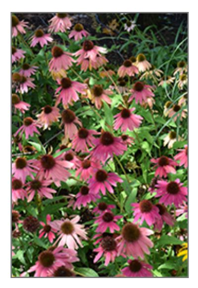
Artisan Red Ombre Coneflower flowers

Artisan Red Ombre Coneflower is a fine choice for the garden, but it is also a good selection for planting in outdoor pots and containers. With its upright habit of growth, it is best suited for use as a 'thriller' in the 'spiller-thriller-filler' container combination; plant it near the center of the pot, surrounded by smaller plants and those that spill over the edges. Note that when growing plants in outdoor containers and baskets, they may require more frequent waterings than they would in the yard or garden. Be aware that in our climate, most plants cannot be expected to survive the winter if left in containers outdoors, and this plant is no exception. Contact our experts for more information on how to protect it over the winter months.