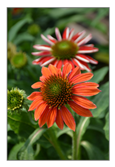
Artisan Red Ombre Coneflower flowers

This is a relatively low maintenance plant, and is best cleaned up in early spring before it resumes active growth for the season. It is a good choice for attracting butterflies to your yard, but is not particularly attractive to deer who tend to leave it alone in favor of tastier treats. It has no significant negative characteristics.