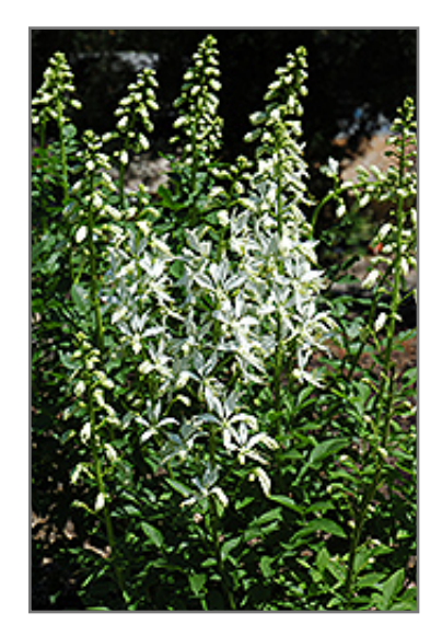
Albiflorus Gas Plant flowers