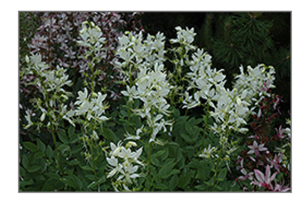
Albiflorus Gas Plant flowers

Albiflorus Gas Plant is an herbaceous perennial with an upright spreading habit of growth. Its medium texture blends into the garden, but can always be balanced by a couple of finer or coarser plants for an effective composition.