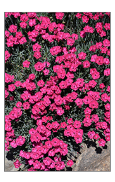
Paint The Town Red Pinks flowers

Breathtaking flowers are red with magenta overtones, above mounds of glaucous blue foliage; great for flower arrangements; deadhead to rebloom; pair up with summer blooming perennials and annuals to time a continued flower display