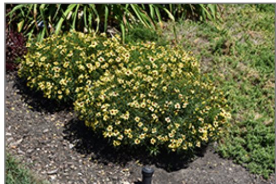
Sizzle And Spice Sassy Saffron Tickseed in bloom