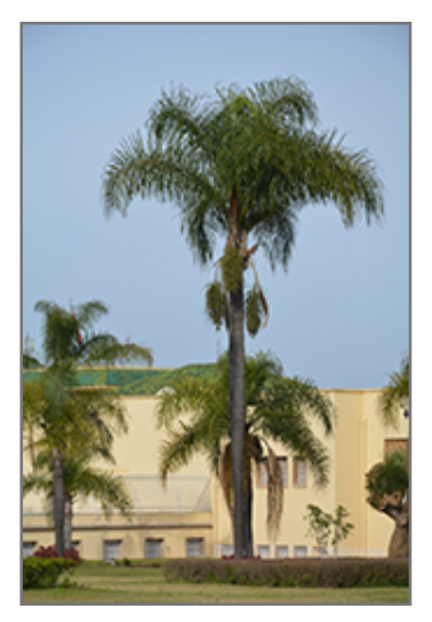
Foxtail Palm

This tropical plant does best in full sun to partial shade. It does best in average to evenly moist conditions, but will not tolerate standing water. It is not particular as to soil type or pH. It is somewhat tolerant of urban pollution. This species is not originally from North America..