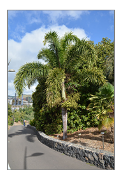
Foxtail Palm