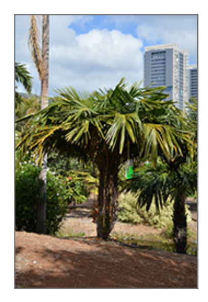
Arikury Palm

Arikury Palm is a fine choice for the yard, but it is also a good selection for planting in outdoor pots and containers. Because of its height, it is often used as a 'thriller' in the 'spiller-thriller-filler' container combination; plant it near the center of the pot, surrounded by smaller plants and those that spill over the edges. It is even sizeable enough that it can be grown alone in a suitable container. Note that when grown in a container, it may not perform exactly as indicated on the tag - this is to be expected. Also note that when growing plants in outdoor containers and baskets, they may require more frequent waterings than they would in the yard or garden. Be aware that in our climate, most plants cannot be expected to survive the winter if left in containers outdoors, and this plant is no exception. Contact our experts for more information on how to protect it over the winter months.