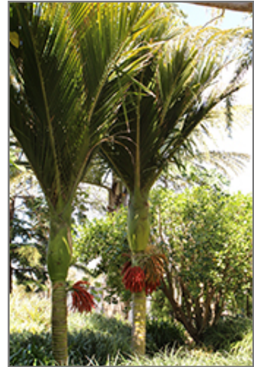
Nikau Palm

This tropical plant does best in full sun to partial shade. It does best in average to evenly moist conditions, but will not tolerate standing water. It is not particular as to soil type or pH, and is able to handle environmental salt. It is somewhat tolerant of urban pollution, and will benefit from being planted in a relatively sheltered location. This species is not originally from North America..