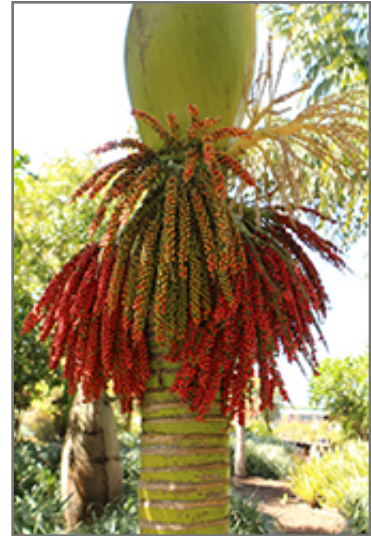
Nikau Palm fruit

Nikau Palm is a fine choice for the yard, but it is also a good selection for planting in outdoor pots and containers. Because of its height, it is often used as a 'thriller' in the 'spiller-thriller-filler' container combination; plant it near the center of the pot, surrounded by smaller plants and those that spill over the edges. It is even sizeable enough that it can be grown alone in a suitable container. Note that when grown in a container, it may not perform exactly as indicated on the tag - this is to be expected. Also note that when growing plants in outdoor containers and baskets, they may require more frequent waterings than they would in the yard or garden. Be aware that in our climate, most plants cannot be expected to survive the winter if left in containers outdoors, and this plant is no exception. Contact our experts for more information on how to protect it over the winter months.