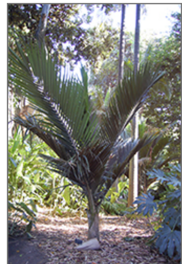
Nikau Palm