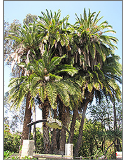
Senegal Date Palm

This tropical plant does best in full sun to partial shade. It does best in average to evenly moist conditions, but will not tolerate standing water. It is not particular as to soil type or pH, and is able to handle environmental salt. It is somewhat tolerant of urban pollution. This species is not originally from North America.