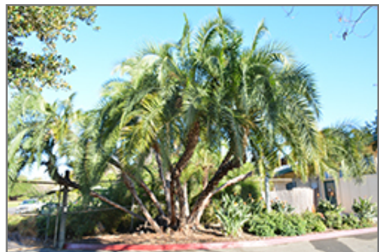
Senegal Date Palm