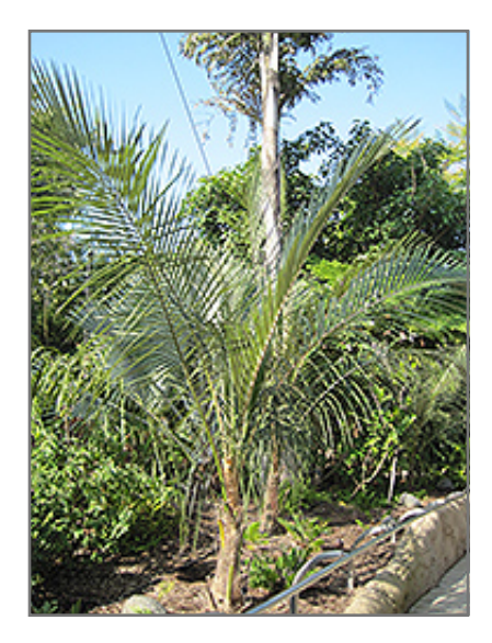
Bolivian Mountain Coconut

This tropical plant does best in full sun to partial shade. It does best in average to evenly moist conditions, but will not tolerate standing water. It is not particular as to soil pH, but grows best in rich soils. It is somewhat tolerant of urban pollution. This species is not originally from North America.