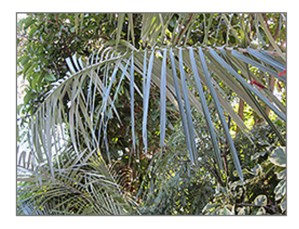
Bolivian Mountain Coconut foliage