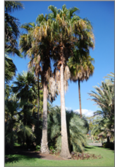
Carnarvon Fan Palm

Carnarvon Fan Palm is a fine choice for the yard, but it is also a good selection for planting in outdoor pots and containers. Because of its height, it is often used as a 'thriller' in the 'spiller-thriller-filler' container combination; plant it near the center of the pot, surrounded by smaller plants and those that spill over the edges. It is even sizeable enough that it can be grown alone in a suitable container. Note that when grown in a container, it may not perform exactly as indicated on the tag - this is to be expected. Also note that when growing plants in outdoor containers and baskets, they may require more frequent waterings than they would in the yard or garden. Be aware that in our climate, most plants cannot be expected to survive the winter if left in containers outdoors, and this plant is no exception. Contact our experts for more information on how to protect it over the winter months.