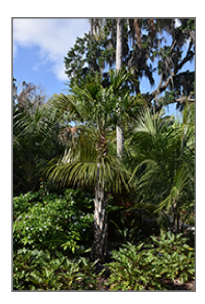
Halifax Fan Palm

Halifax Fan Palm is a fine choice for the yard, but it is also a good selection for planting in outdoor pots and containers. Because of its height, it is often used as a 'thriller' in the 'spiller-thriller-filler' container combination; plant it near the center of the pot, surrounded by smaller plants and those that spill over the edges. It is even sizeable enough that it can be grown alone in a suitable container. Note that when grown in a container, it may not perform exactly as indicated on the tag - this is to be expected. Also note that when growing plants in outdoor containers and baskets, they may require more frequent waterings than they would in the yard or garden. Be aware that in our climate, most plants cannot be expected to survive the winter if left in containers outdoors, and this plant is no exception. Contact our experts for more information on how to protect it over the winter months.