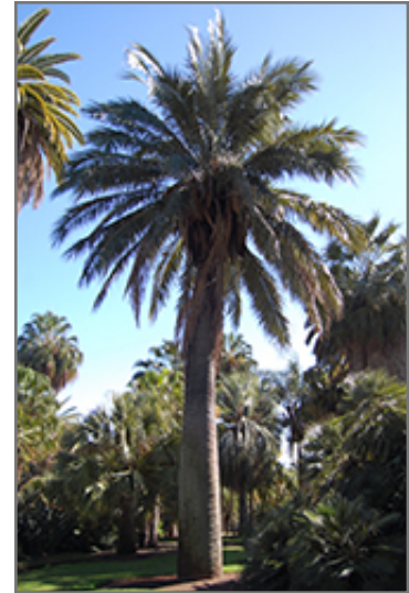
Chilean Wine Palm

This tropical plant does best in full sun to partial shade. It does best in average to evenly moist conditions, but will not tolerate standing water. It is not particular as to soil type or pH. It is somewhat tolerant of urban pollution. This species is not originally from North America.