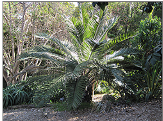
Chilean Wine Palm Photo courtesy of NetPS Plant Finder