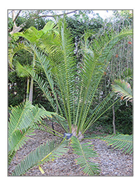
Whitelock's Cycad

This tropical plant does best in full sun to partial shade. It does best in average to evenly moist conditions, but will not tolerate standing water. It is particular about its soil conditions, with a strong preference for rich, acidic soils. It is quite intolerant of urban pollution, therefore inner city or urban streetside plantings are best avoided. This species is not originally from North America, and parts of it are known to be toxic to humans and animals, so care should be exercised in planting it around children and pets. It can be propagated by division.