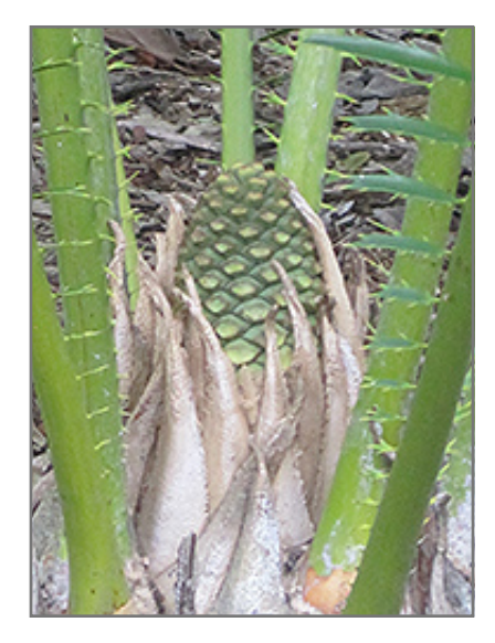
Whitelock's Cycad fruit