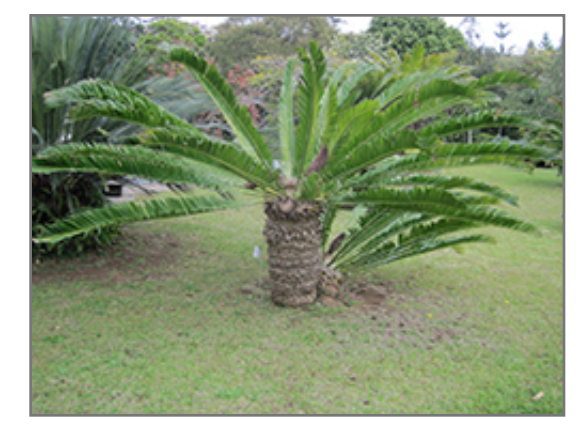
Modjadji Cycad

Modjadji Cycad will grow to be about 30 feet tall at maturity, with a spread of 15 feet. It has a high canopy with a typical clearance of 6 feet from the ground, and should not be planted underneath power lines. As it matures, the lower branches of this tree can be strategically removed to create a high enough canopy to support unobstructed human traffic underneath. It grows at a fast rate, and under ideal conditions can be expected to live to a ripe old age of 200 years or more; think of this as a heritage tropical plant for future generations! This is a dioecious species, meaning that individual plants are either male or female. Only the females will produce fruit, and a male variety of the same species is required nearby as a pollinator.