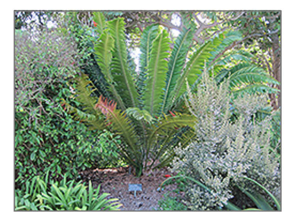
Modjadji Cycad

This tropical plant does best in full sun to partial shade. It does best in average to evenly moist conditions, but will not tolerate standing water. It is not particular as to soil pH, but grows best in rich soils. It is quite intolerant of urban pollution, therefore inner city or urban streetside plantings are best avoided. This species is not originally from North America, and parts of it are known to be toxic to humans and animals, so care should be exercised in planting it around children and pets. It can be propagated by division.