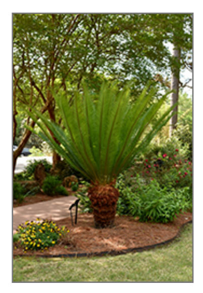
Emperor Sago Palm

This tropical plant does best in full sun to partial shade. It does best in average to evenly moist conditions, but will not tolerate standing water. It is not particular as to soil pH, but grows best in sandy soils. It is somewhat tolerant of urban pollution. Consider applying a thick mulch around the root zone in winter to protect it in exposed locations or colder microclimates. This species is not originally from North America, and parts of it are known to be toxic to humans and animals, so care should be exercised in planting it around children and pets.