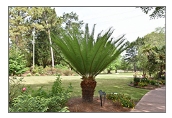
Emperor Sago Palm