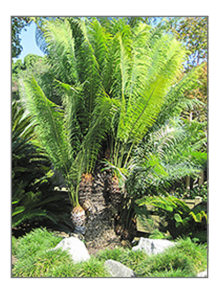
Queen Sago Palm

This tropical plant does best in full sun to partial shade. It does best in average to evenly moist conditions, but will not tolerate standing water. It is not particular as to soil pH, but grows best in sandy soils. It is somewhat tolerant of urban pollution. Consider applying a thick mulch around the root zone in winter to protect it in exposed locations or colder microclimates. This species is not originally from North America, and parts of it are known to be toxic to humans and animals, so care should be exercised in planting it around children and pets.