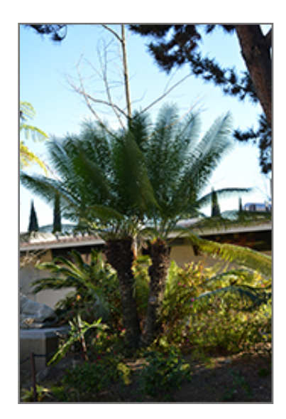
Queen Sago Palm