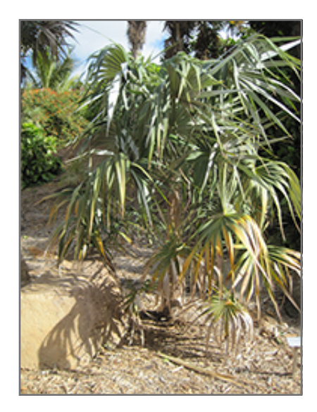
Blue Silver Palm

This tropical plant does best in full sun to partial shade. It does best in average to evenly moist conditions, but will not tolerate standing water. It is not particular as to soil type or pH, and is able to handle environmental salt. It is somewhat tolerant of urban pollution, and will benefit from being planted in a relatively sheltered location. This species is not originally from North America. It can be propagated by cuttings.