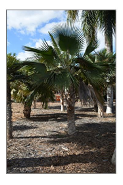
Short Hair Old Man Palm

Short Hair Old Man Palm will grow to be about 10 feet tall at maturity, with a spread of 8 feet. It has a high canopy with a typical clearance of 4 feet from the ground, and is suitable for planting under power lines. It grows at a slow rate, and under ideal conditions can be expected to live for approximately 30 years.