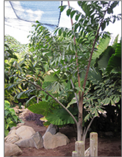
Zebra Fishtail Palm

This tropical plant does best in partial shade to shade. It does best in average to evenly moist conditions, but will not tolerate standing water. It is not particular as to soil pH, but grows best in rich soils. It is somewhat tolerant of urban pollution, and will benefit from being planted in a relatively sheltered location. This species is not originally from North America, and parts of it are known to be toxic to humans and animals, so care should be exercised in planting it around children and pets..