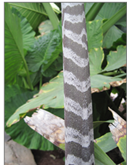
Zebra Fishtail Palm bark