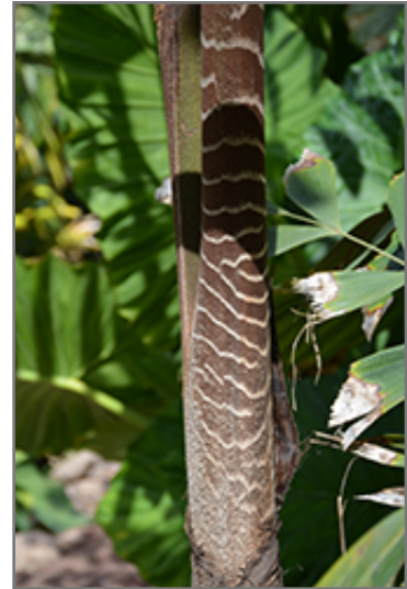
Zebra Fishtail Palm bark

Zebra Fishtail Palm is a fine choice for the yard, but it is also a good selection for planting in outdoor pots and containers. Because of its height, it is often used as a 'thriller' in the 'spiller-thriller-filler' container combination; plant it near the center of the pot, surrounded by smaller plants and those that spill over the edges. It is even sizeable enough that it can be grown alone in a suitable container. Note that when grown in a container, it may not perform exactly as indicated on the tag - this is to be expected. Also note that when growing plants in outdoor containers and baskets, they may require more frequent waterings than they would in the yard or garden. Be aware that in our climate, most plants cannot be expected to survive the winter if left in containers outdoors, and this plant is no exception. Contact our experts for more information on how to protect it over the winter months.