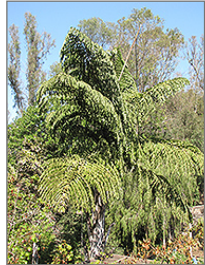
Toddy Fishtail Palm

This tropical plant does best in full sun to partial shade. It does best in average to evenly moist conditions, but will not tolerate standing water. It is not particular as to soil pH, but grows best in rich soils. It is somewhat tolerant of urban pollution, and will benefit from being planted in a relatively sheltered location. This species is not originally from North America, and parts of it are known to be toxic to humans and animals, so care should be exercised in planting it around children and pets..