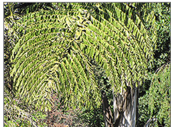
Toddy Fishtail Palm foliage