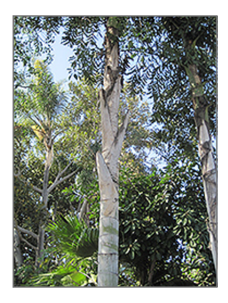
Giant Mountain Fishtail Palm bark