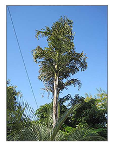
Giant Mountain Fishtail Palm

This tropical plant does best in full sun to partial shade. It does best in average to evenly moist conditions, but will not tolerate standing water. It is particular about its soil conditions, with a strong preference for rich, acidic soils. It is somewhat tolerant of urban pollution, and will benefit from being planted in a relatively sheltered location. This species is not originally from North America, and parts of it are known to be toxic to humans and animals, so care should be exercised in planting it around children and pets..