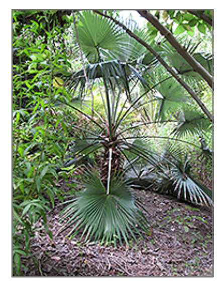
Rock Palm

This tropical plant does best in full sun to partial shade. It is very adaptable to both dry and moist growing conditions, but will not tolerate any standing water. It is considered to be drought-tolerant, and thus makes an ideal choice for xeriscaping or the moisture-conserving landscape. It is not particular as to soil pH, but grows best in sandy soils. It is somewhat tolerant of urban pollution. This species is not originally from North America.