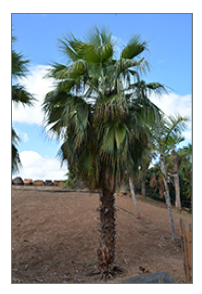
San Jose Hesper Palm

This tropical plant should only be grown in full sunlight. It is very adaptable to both dry and moist growing conditions, but will not tolerate any standing water. It is considered to be drought-tolerant, and thus makes an ideal choice for xeriscaping or the moisture-conserving landscape. It is not particular as to soil pH, but grows best in sandy soils, and is able to handle environmental salt. It is somewhat tolerant of urban pollution. This species is not originally from North America.