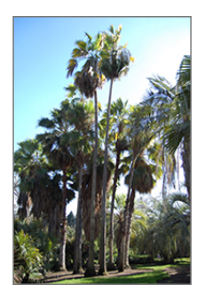
San Jose Hesper Palm