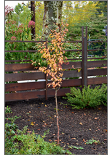
Milk And Honey Japanese Stewartia in fall