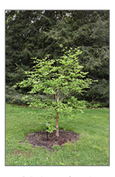
Ballet Japanese Stewartia

Ballet Japanese Stewartia features delicate white cup-shaped flowers with orange anthers along the branches in mid summer. It has forest green deciduous foliage. The pointy leaves turn outstanding shades of orange and in the fall. The mottled khaki (brownish-green) bark is extremely showy and adds significant winter interest.