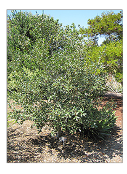
Canyon Live Oak