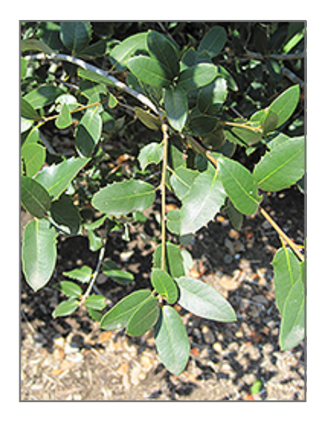
Canyon Live Oak foliage