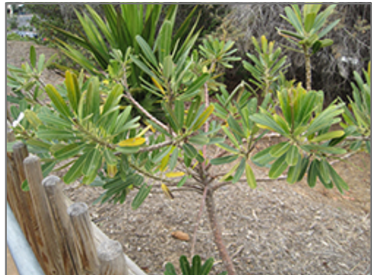
Singapore Plumeria