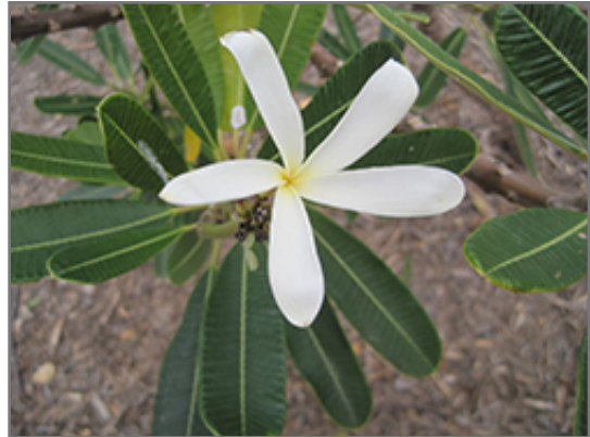
Singapore Plumeria flowers

Singapore Plumeria is recommended for the following landscape applications;