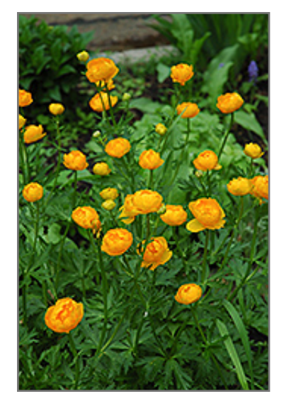
Orange Globe Globeflower flowers

Orange Globe Globeflower has masses of beautiful double orange round flowers at the ends of the stems from late spring to early summer, which are most effective when planted in groupings. The flowers are excellent for cutting. Its deeply cut lobed leaves remain dark green in colour throughout the season.