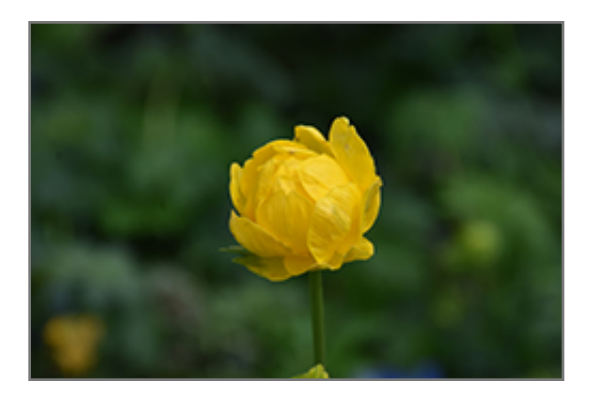
Lemon Queen Globeflower flowers