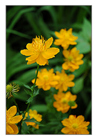
Globeflower flowers

Globeflower has masses of beautiful gold buttercup flowers with orange anthers at the ends of the stems from late spring to early summer, which are most effective when planted in groupings. The flowers are excellent for cutting. Its deeply cut lobed leaves remain dark green in colour throughout the season.