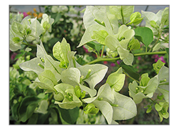
Jamaica White Bougainvillea in bloom

This is a multi-stemmed evergreen houseplant with a spreading, ground-hugging habit of growth. This plant can be pruned at any time to keep it looking its best.