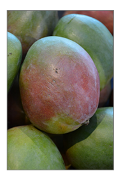
Kent Mango fruit

This is an evergreen tree with a more or less rounded form. Its average texture blends into the landscape, but can be balanced by one or two finer or coarser trees or shrubs for an effective composition. This is a relatively low maintenance plant, and may require the occasional pruning to look its best. It is a good choice for attracting birds and bees to your yard. It has no significant negative characteristics.