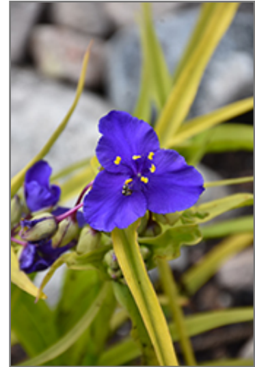
Sweet Kate Spiderwort flowers

This plant does best in partial shade to shade. It requires an evenly moist well-drained soil for optimal growth. It is not particular as to soil type or pH. It is highly tolerant of urban pollution and will even thrive in inner city environments. Consider applying a thick mulch around the root zone in winter to protect it in exposed locations or colder microclimates. This particular variety is an interspecific hybrid. It can be propagated by division; however, as a cultivated variety, be aware that it may be subject to certain restrictions or prohibitions on propagation.