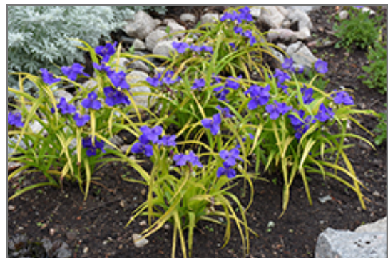
Sweet Kate Spiderwort in bloom