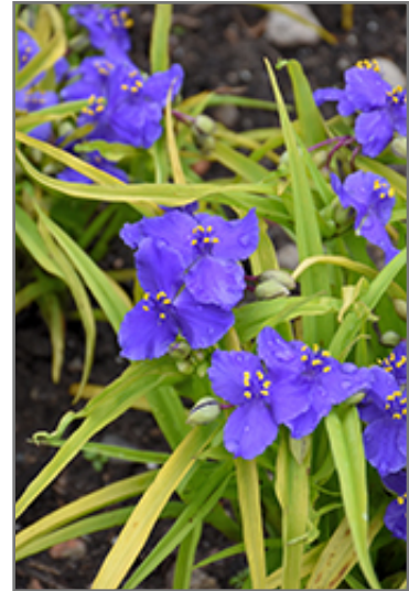
Sweet Kate Spiderwort flowers