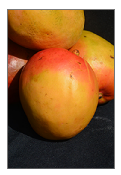
Tommy Atkins Mango fruit

Tommy Atkins Mango has attractive dark green foliage with light green veins which emerges coppery-bronze in spring on a tree with a round habit of growth. The glossy pointy leaves are highly ornamental and remain dark green throughout the winter.