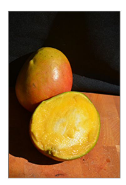
Tommy Atkins Mango fruit and flesh