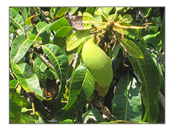
Mango fruit

Mango has attractive dark green foliage with light green veins which emerges coppery-bronze in spring on a tree with a round habit of growth. The glossy pointy leaves are highly ornamental and remain dark green throughout the winter.