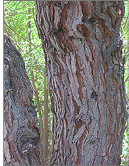
Small's Sweet Acacia bark

This tree does best in full sun to partial shade. It is very adaptable to both dry and moist growing conditions, but will not tolerate any standing water. It is considered to be drought-tolerant, and thus makes an ideal choice for xeriscaping or the moisture-conserving landscape. It is not particular as to soil pH, but grows best in sandy soils. It is somewhat tolerant of urban pollution. This species is not originally from North America..