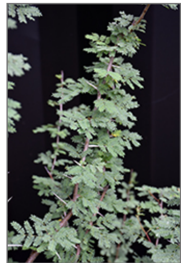
Small's Sweet Acacia foliage