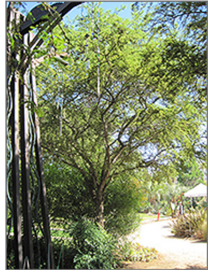
Small's Sweet Acacia

This is a relatively low maintenance tree, and should only be pruned after flowering to avoid removing any of the current season's flowers. It is a good choice for attracting birds, bees and butterflies to your yard, but is not particularly attractive to deer who tend to leave it alone in favor of tastier treats. Gardeners should be aware of the following characteristic(s) that may warrant special consideration;