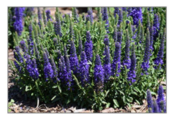
Vespers Blue Speedwell flowers

Vespers Blue Speedwell has masses of beautiful spikes of blue flowers rising above the foliage from late spring to early summer, which emerge from distinctive navy blue flower buds, and which are most effective when planted in groupings. Its glossy narrow leaves remain forest green in colour throughout the year.