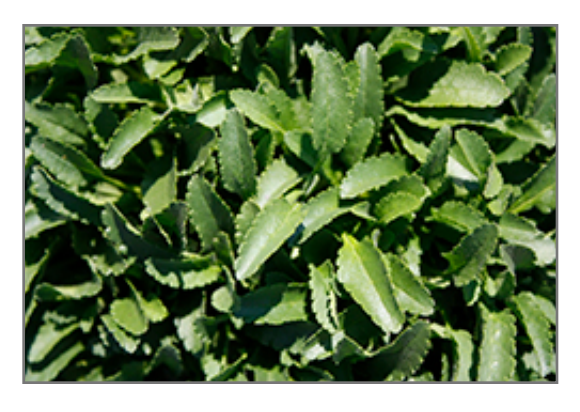
Vespers Blue Speedwell foliage