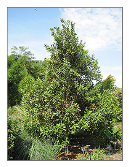
Macadamia Nut