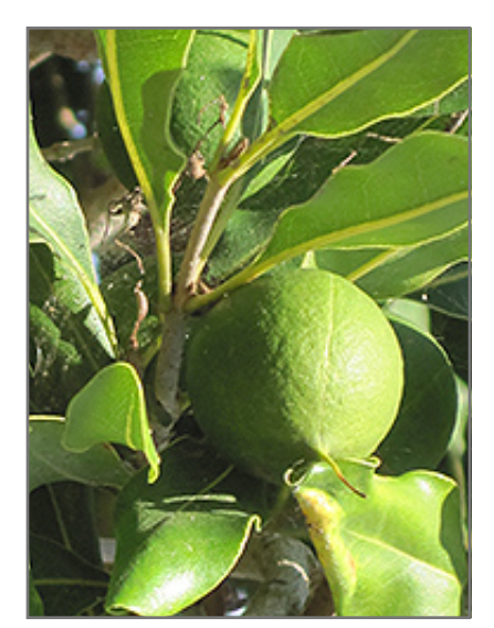
Macadamia Nut fruit

Macadamia Nut features showy racemes of lightly-scented white flowers with shell pink overtones at the ends of the branches from early to late spring. It has green evergreen foliage. The glossy oval leaves remain green throughout the winter. It produces green nuts from early to late fall. The fruit can be messy if allowed to drop on the lawn or walkways, and may require occasional clean-up.