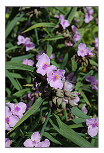
Perrine's Pink Spiderwort flowers

Perrine's Pink Spiderwort has masses of beautiful clusters of shell pink flowers with lavender overtones at the ends of the stems from early to late summer, which are most effective when planted in groupings. Its attractive grassy leaves remain bluish-green in colour with prominent deep purple stripes throughout the season.