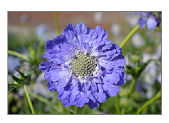
Fama Blue Pincushion Flower flowers

This is the largest flowering variety, producing pretty, lavender-blue blooms on wiry stems above fine, ferny, cutleaf foliage; starts blooming in early summer and may continue into fall; a spectacular show for a sunny garden; deadhead spent flowers