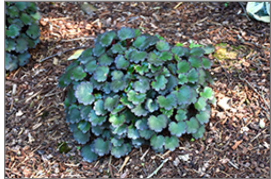
Pink Elf Saxifrage