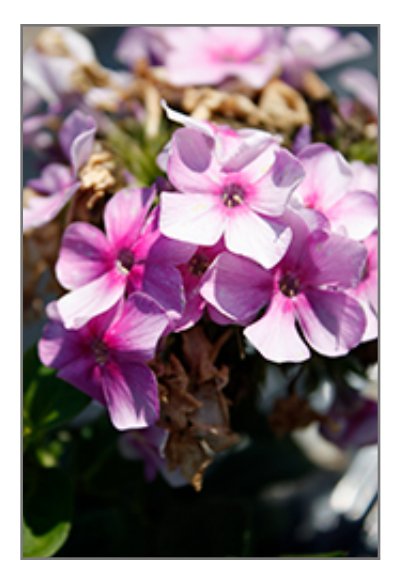
Bambini Lucky Lilac Dwarf Garden Phlox flowers

Long lasting, fragrant lilac-pink flowers from early summer until fall; excellent compact branching, with flowers in abundance all season; suitable for containers, perennial borders or mass planting; good mildew resistance