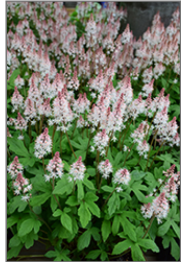
Spring Symphony Foamflower in bloom

Spring Symphony Foamflower is recommended for the following landscape applications;