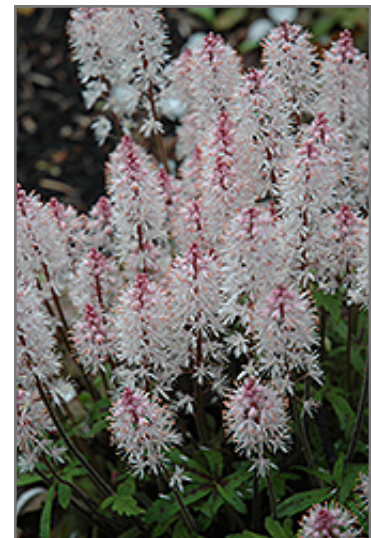
Spring Symphony Foamflower flowers