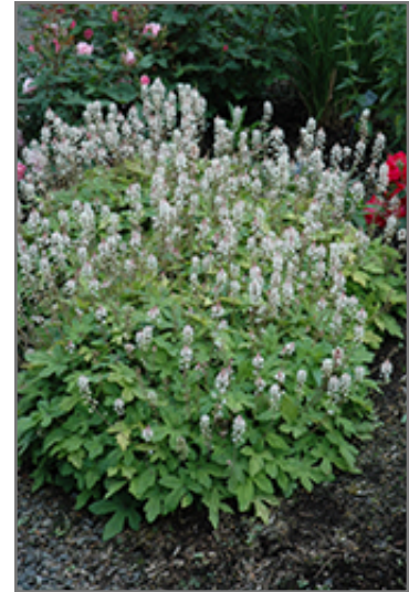
Spring Symphony Foamflower in bloom

Spring Symphony Foamflower is a fine choice for the garden, but it is also a good selection for planting in outdoor pots and containers. It is often used as a 'filler' in the 'spiller-thriller-filler' container combination, providing a mass of flowers and foliage against which the larger thriller plants stand out. Note that when growing plants in outdoor containers and baskets, they may require more frequent waterings than they would in the yard or garden. Be aware that in our climate, most plants cannot be expected to survive the winter if left in containers outdoors, and this plant is no exception. Contact our experts for more information on how to protect it over the winter months.