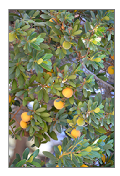
Bluebush fruit

Bluebush has grayish green evergreen foliage on a tree with a round habit of growth. The oval leaves remain grayish green throughout the winter.