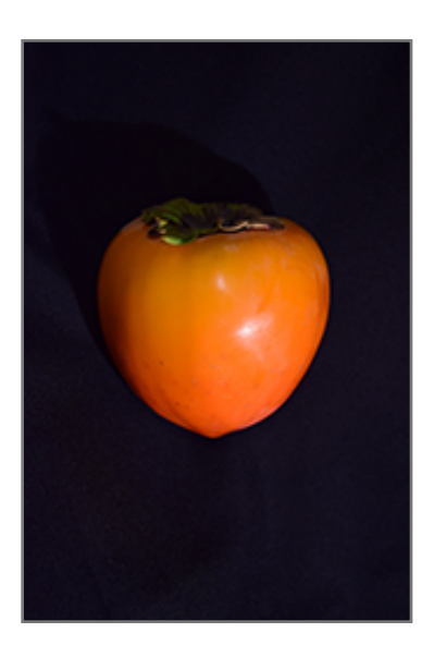
Gionbo Japanese Persimmon fruit

This is an open multi-stemmed deciduous tree with a more or less rounded form. Its average texture blends into the landscape, but can be balanced by one or two finer or coarser trees or shrubs for an effective composition. This is a high maintenance plant that will require regular care and upkeep, and is best pruned in late winter once the threat of extreme cold has passed. It is a good choice for attracting birds to your yard. It has no significant negative characteristics.